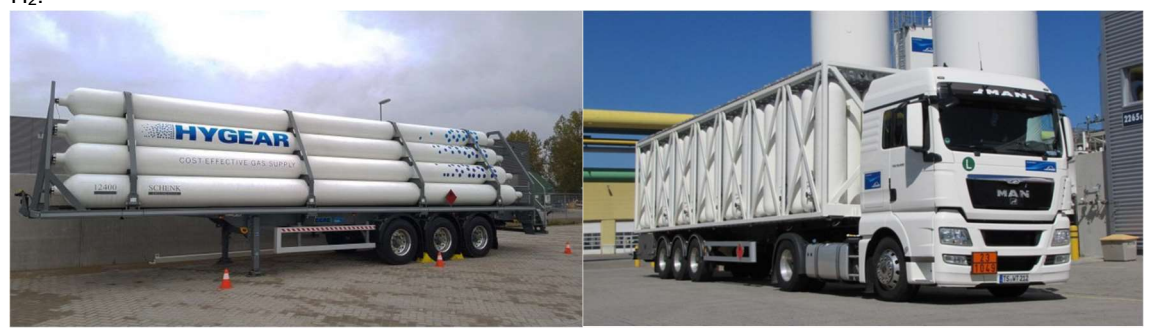
Figure 1: A tube trailer and composite cylinders battery pack as operated by Linde gas

First, it is important to realize that in the majority of the foreseen applications, (highly) compressed Hydrogen (or CGH_2 as opposite to LH_2 ) is used. Although some marine applications are talking about liquefied Hydrogen ( LH_2 ), this is still a rare situation in The Netherlands. LH_2 requires extreme cryogenic and expensive cooling, which makes it economically less attractive. Incentives to use Hydrogen as an automotive fuel are already being rolled out, where a fuelling station either generates its own Hydrogen gas by means of electrolysis or receives Hydrogen from delivery trucks. These trucks were originally tube trailers, carrying 9 to 14 steel cylinders of approximately 3 m³ at pressures around 200 bar, ending up with a storage capacity of 350 kg of H_2 .