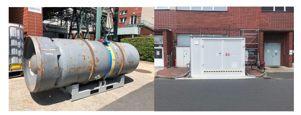
Figure 1: Ammonia pressure vessel and station

The vessel is also connected to the pipeline leading to the production hall by a pressure hose, which is terminated by a shut-off valve. This serves to prevent ammonia leakage when containers are replaced. Ammonia is taken into operation in a liquid state during operation. The ammonia pressure is automatically maintained between 5 bar and 20 bar, which corresponds to temperatures from 10°C to 53°C. To ensure liquid ammonia even during transport to the first floor, it is subcooled below the evaporating temperature using cooled glycol (Safety program, 2021). The pressure station is equipped with continuous leak detection and an electrical fire alarm device to which a smoke detector and a water semi-stable fire extinguishing device are connected.