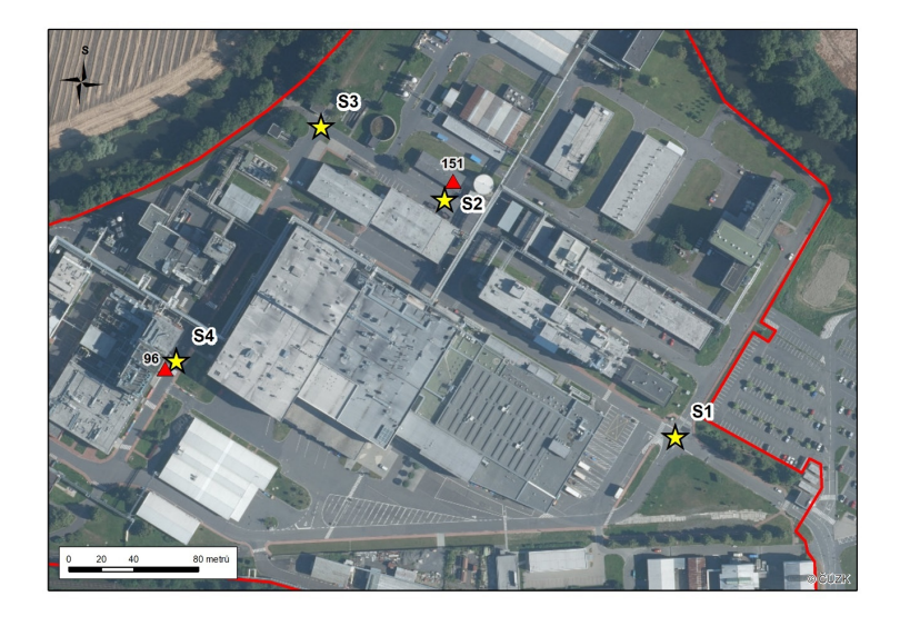
Figure 2: Location of possible ammonia leakage inside of the Seveso establishment

Estimation of the frequency of accident scenarios was carried out in accordance with Guideline for quantitative risk assessment (Purple Book, 2005). First, the LOCs for pressure vessels (stationary) are considered G.1 Instantaneous release of the complete inventory, G.2 Continuous release of the complete inventory in 10 min at a constant rate of release and G.3 Continuous release from a hole with an effective diameter of 10 mm. Frequencies of LOCs for stationary vessels were used from (seed Table 2).