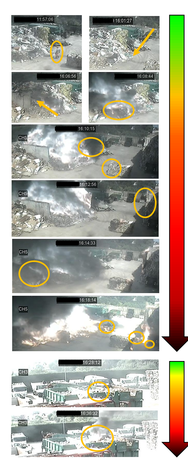
Figure 2: Timeline of the events involved in the fire.