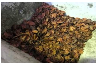
Figure 2: Shell of Carya illinoensis

The shell of Carya illinoensis , known by the common name of pecan (Figure 2), was obtained in an agricultural field to produce this product in the Ica region, where it's considered as a residue of the shelling process and separation of the edible part. called pecan nut.