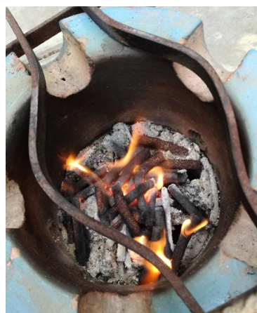
Figure 5: Energy Efficiency Test