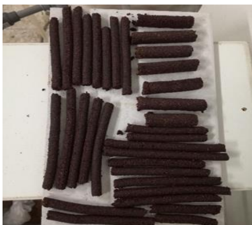
Figure 4: Drying of Carya illinoensis pellets

Homogenized mixtures were prepared for 10 minutes with a 1:1 ratio between pecan shell and binder (150 g of each) using 200 mL of water. Humidity, volatile material, fixed carbon, and ashes were determined from this mixture. With a mixture of biomass and binder, two-dimensional pellets were made: 10 mm in diameter by 20 mm long and 15 mm in diameter by 20 mm long, using a mold and equipment with a pressure of 1 ton for densification. The elaborated pellets were dried at room temperature for 7 days (Figure 4). The already dry pellets were characterized around the calorific power, as well as the energy efficiency. See Figure 3