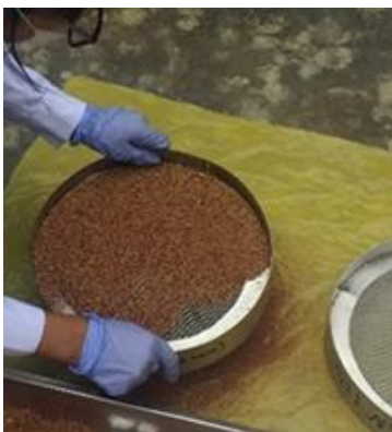
Figure 3: Screening of Carya illinoensis Shell