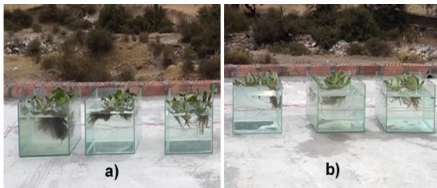
Figure 2: Macrophyte plants: a) Eichhornia crassipes and b) Pistia stratiotes

Figure 2 shows the images of the macrophyte plants used in the study. Eichhornia crassipes presented abundant well-developed lateral roots, with sizes ranging from 2 to 3 cm, and its leaves were rounded and green in color. Meanwhile, Pistia stratiotes presented roots that varied in size from 1 to 2 cm, and its leaves were trapezoid-shaped and green in color.