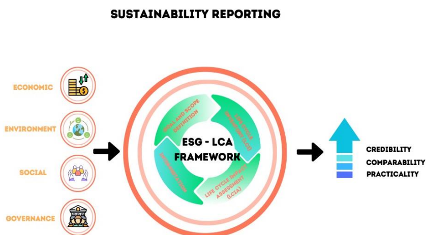
Figure 1: ESG-LCA Framework for sustainability reporting

Figure 1 illustrates the ESG-LCA framework, which integrates economic, environmental, social, and governance dimensions into Life Cycle Assessment (LCA) to enhance sustainability reporting in terms of credibility, comparability, and practicality. This framework adheres to the ISO (2006) standards and includes the four main components: Goal and Scope Definition, Life Cycle Inventory (LCI), Life Cycle Impact Assessment (LCIA), and Interpretation Phase.